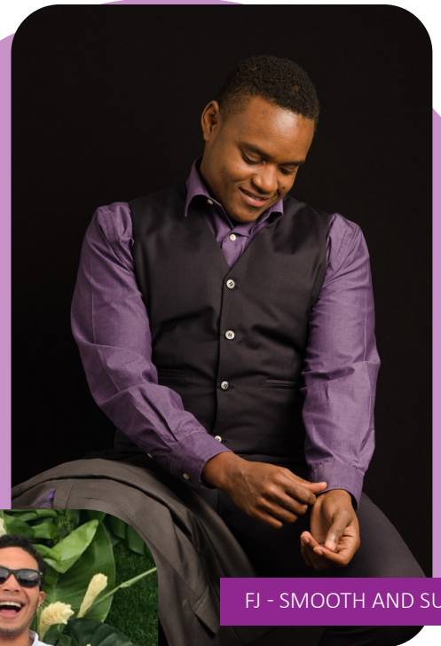
FJ - SMOOTH AND SUAVE